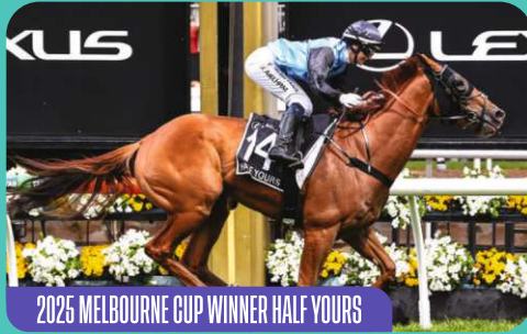
2025 MELBOURNE CUP WINNER HALF YOURS

MELBOURNE, AUSTRALIA OCTOBER - NOVEMBER 2026