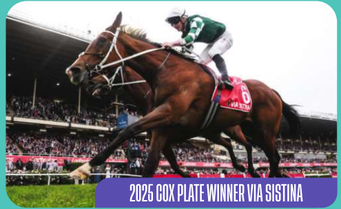
2025 COX PLATE WINNER VIA SISTINA